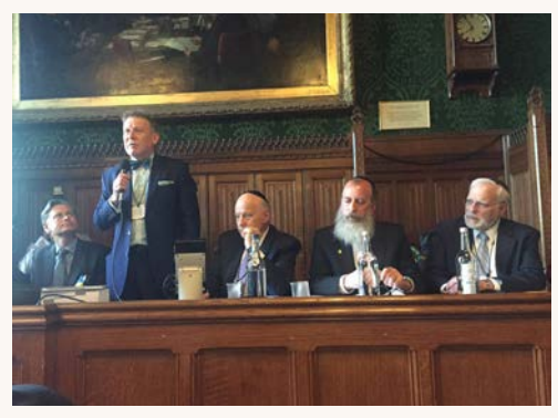
British Parliament Launches UK Committee for the Preservation of Har Hazeisim.

Extraordinary Event in British Parliament Launches UK Committee for the Preservation of Har Hazeisim; Prince Charles Sends Emissary with Special Greetings