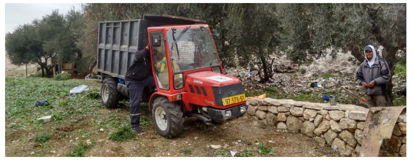
THE MUNICIPALITY OF JERUSALEM BEGINS CLEAN-UP NEAR GRAVE OF THE SAINTLY BARTENURA.

For the Arab residents of Silwan, the small mount above the grave of the saintly Bartenura has become a dumping ground for garbage, creating a stench and an awful sight overlooking the holy cemetery. The ICPHH recently joined a group of municipal officials to evaluate the possibility of cleaning up the area. Rav Ovadiah ben Abraham of Bartenura (1445 -1515) came to Jerusalem from Italy and is best known for his popular commentary on the Mishnah, commonly known as "The Bartenura". In his later years, he rejuvenated the Jewish community of Jerusalem and became recognized as the spiritual leader of the Jews of his generation. In addition to being a great tzaddik and gaon, the Bartenura built the first yeshiva in 1000 years and many institutions for the elderly and poor including a hospital. He also got the Muslim authorities to eliminate a tax on the Jews. The Bartenura's kever is just below the troublesome Silwan neighborhood. The Arabs who live in the apartments above simply dump their refuse on the cemetery below. This will now become a major priority of the ICPHH.