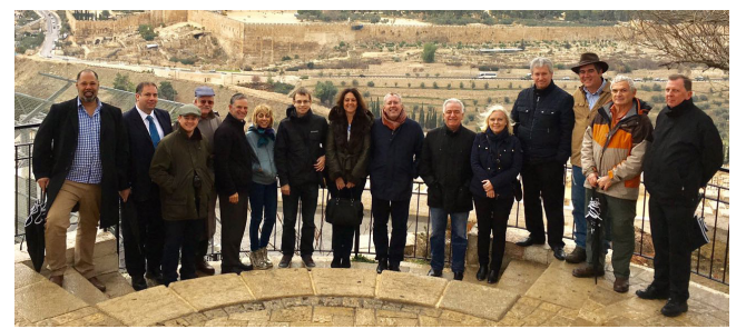
MEMBERS OF THE EUROPEAN UNION ON A TOUR OF HAR HAZEISIM HOSTED BY THE ICPHH