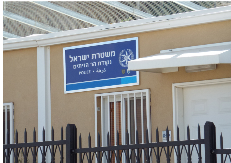
THE POLICE STATION ON HAR HAZEISIM