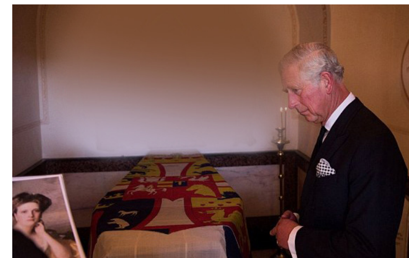
PRINCE CHARLES AT THE GRAVESITE OF HIS GRANDMOTHER PRINCESS ALICE WHO IS BURIED ON HAR HAZEISIM.

she was in Athens. After her death it was found that Princess Alice had requested to be buried on Har Hazeisim and she is in fact interred in the garden of Gethsemane, the small Catholic cemetery on Har Hazeisim. Prince Charles visited the grave of his grandmother when he was in Israel for the funeral of Shimon Peres. Prince Philip is also believed to have made at least one private visit to the grave of his mother.