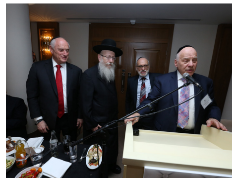
MENACHEM LUBINSKY INTRODUCING RABBI YAAKOV LITZMAN, THE FORMER MINISTER OF HEALTH