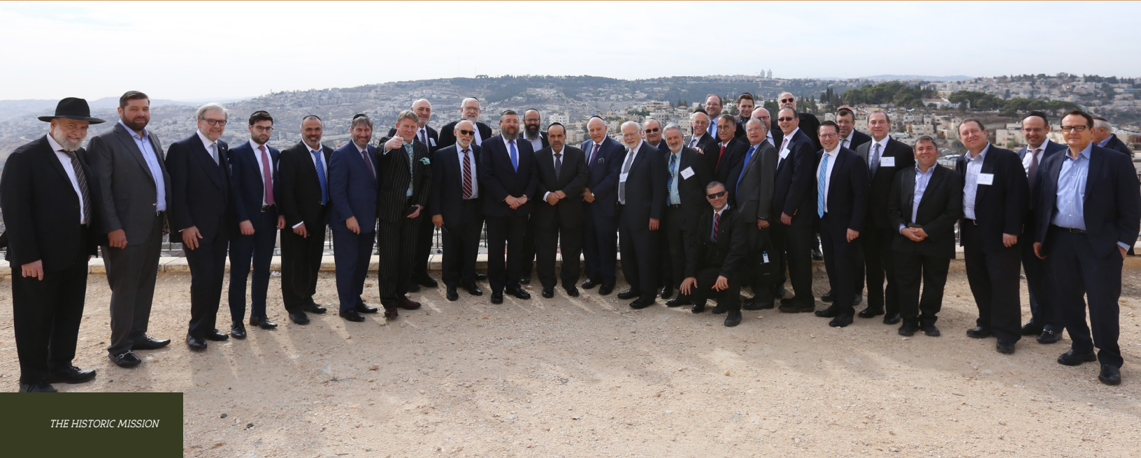
THE HISTORIC MISSION