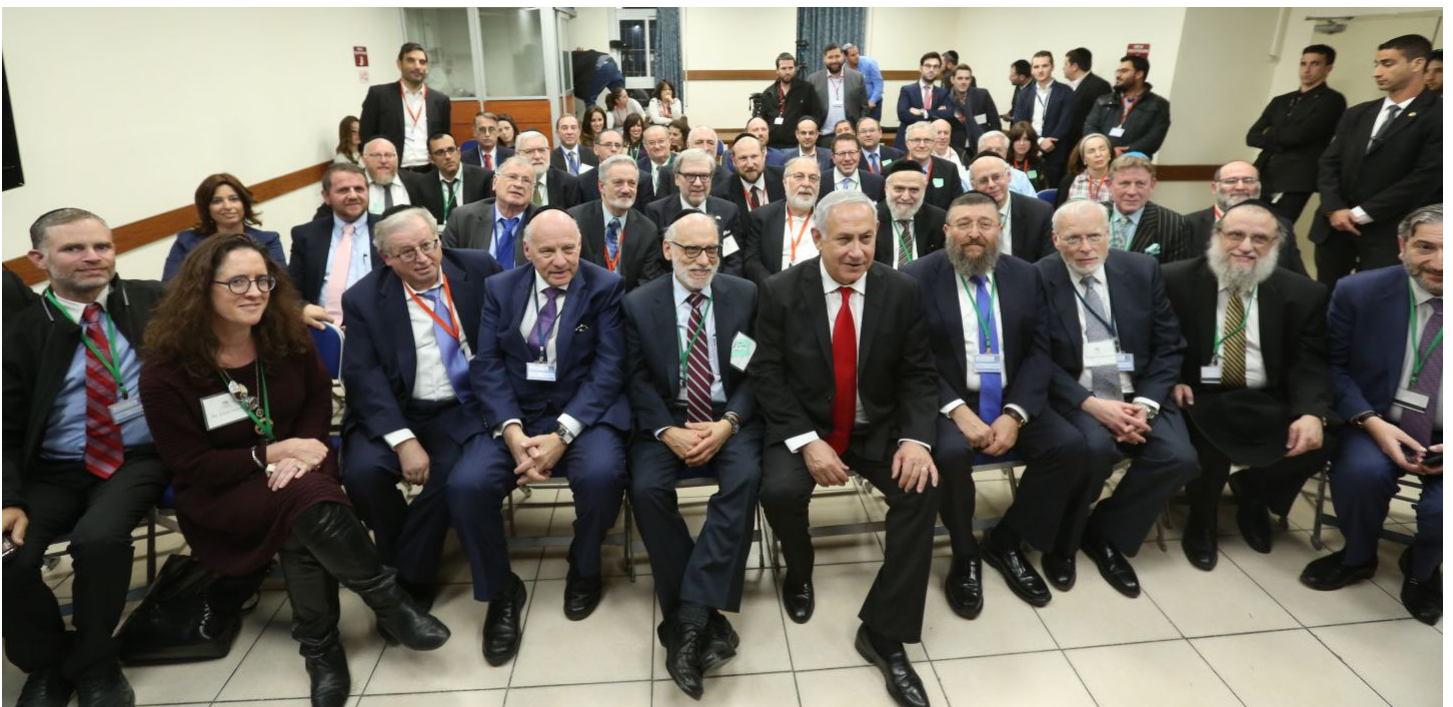
PRIME MINISTER BENJAMIN NETANYAHU WITH MISSION PARTICIPANTS

For 50 participants from the US, Israel and Europe, the 3-day mission of the ICHH could not have been more successful. It not only celebrated the establishment of the largest Knesset caucus in history (67) from every political faction except for the United Arab List; it sent a strong united message that Har Hazeitim will be protected and restored to its original glory at all costs. The 3-day mission began on Monday December 4th with a meeting with Israel's Chief Rabbis and ended on Wednesday December 6th with a reception by Israel's President Reuven Rivlin. In this newsletter, we are pleased to bring you the amazing brief highlights from the extraordinary 3-day mission.