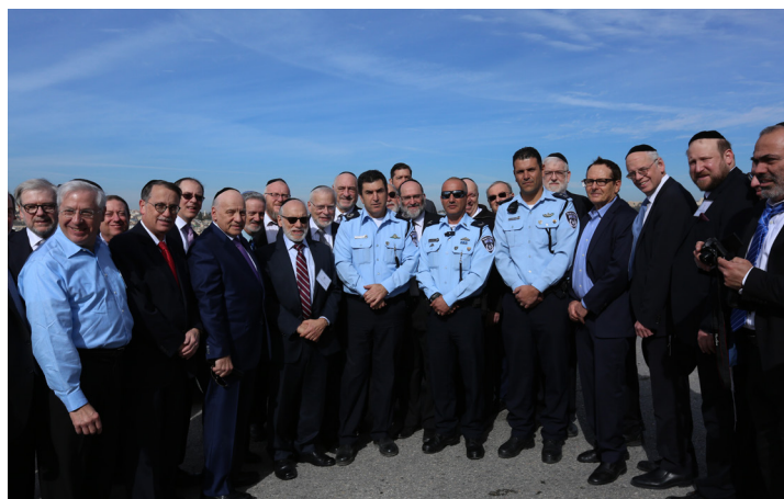
MISSION PARTICIPANTS WITH JERUSALEM'S COMMANDER, YORAM LEVI AND OTHER HIGH-RANKING POLICE OFFICERS