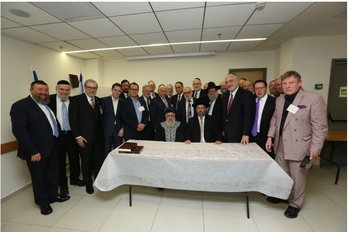
MISSION PARTICIPANTS MEETING WITH ISRAEL'S CHIEF RABBIS, RABBI YITZCHOK YOSEF, THE RISHON LETZION AND RABBI DOVID LAU